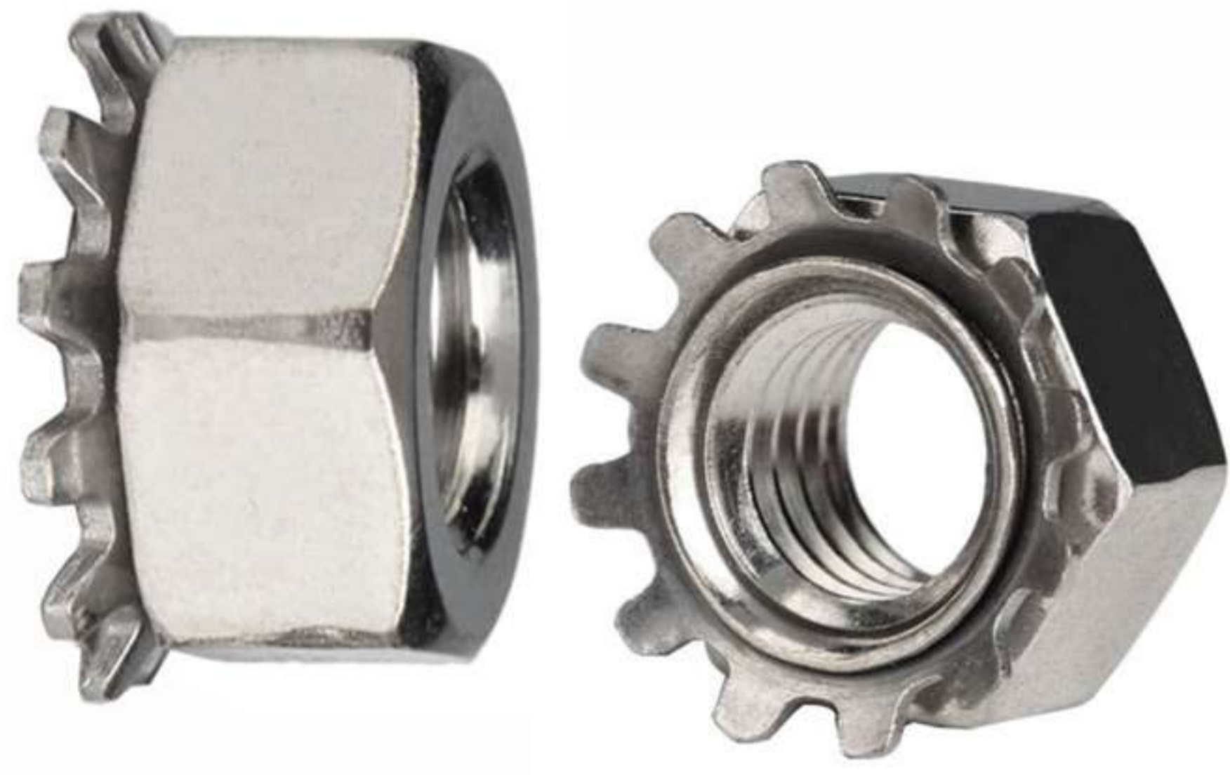
Keps - K Lock Nuts