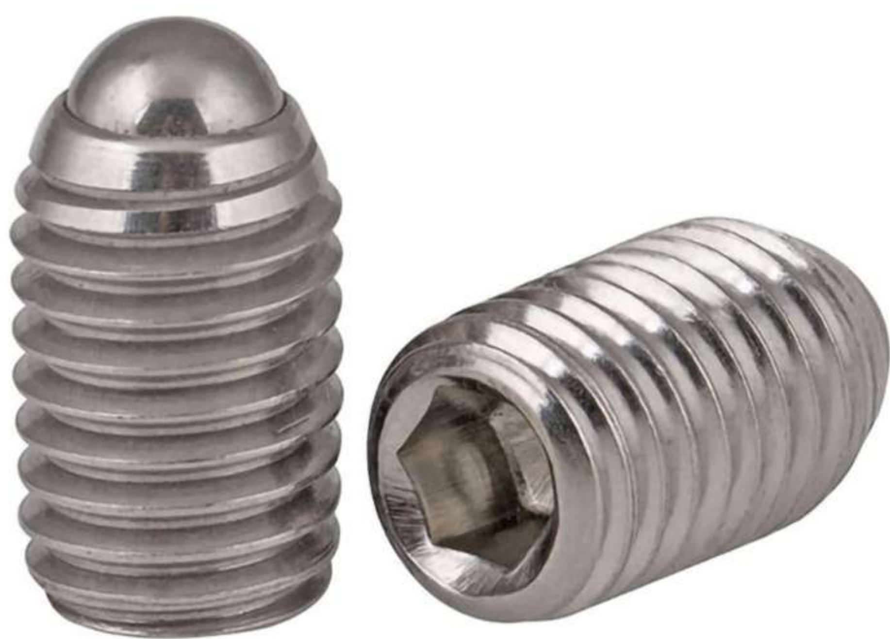
Hex Socket Set Screws