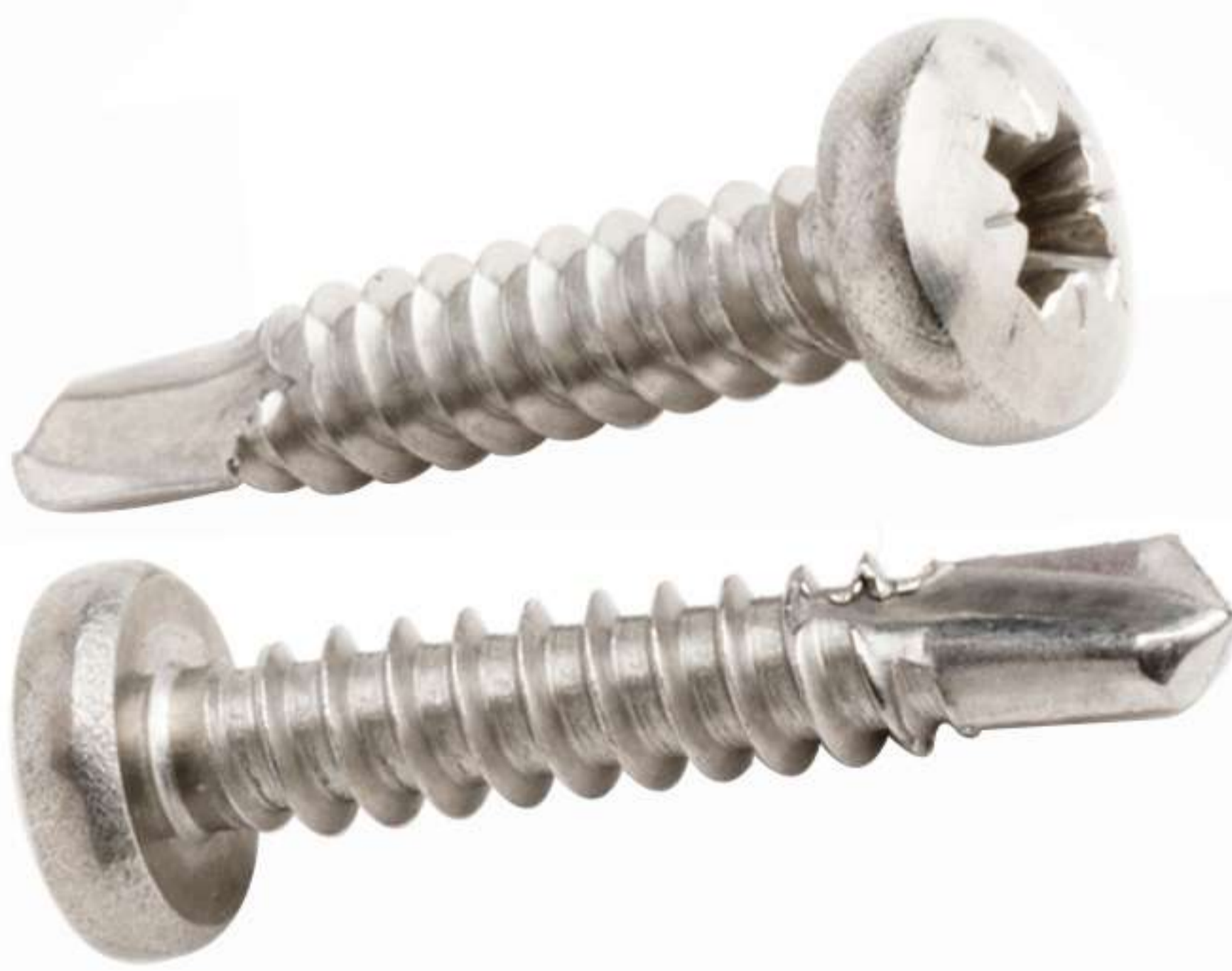
Pan Head Screws