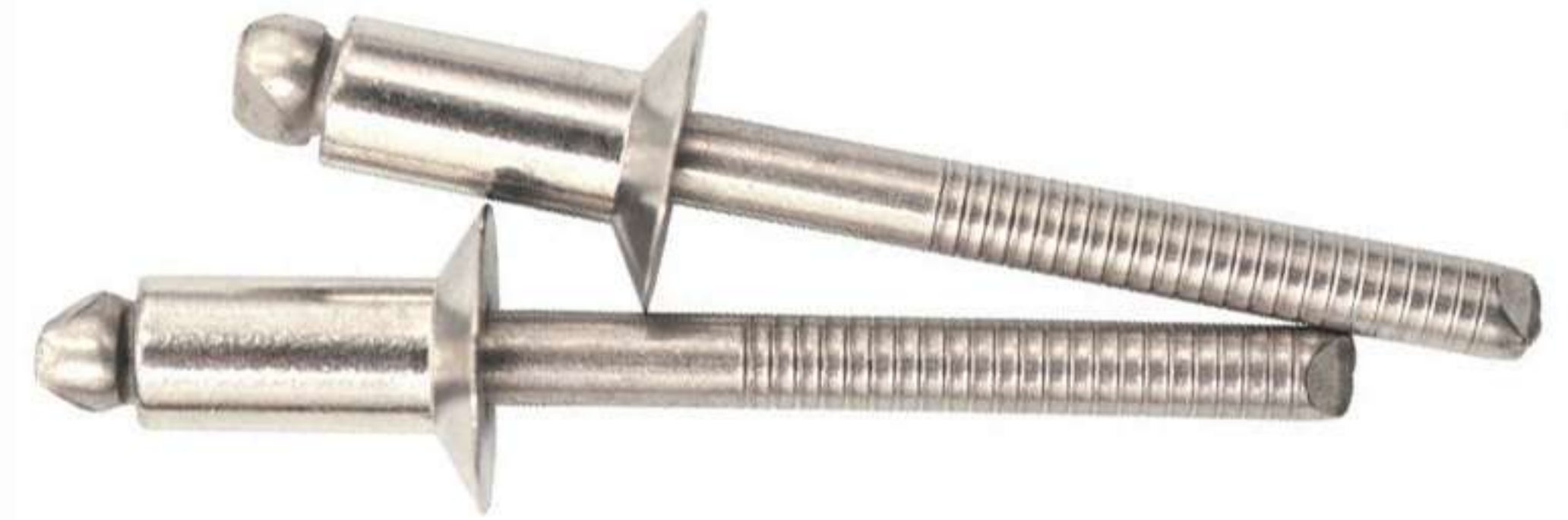
Countersunk Head Rivets