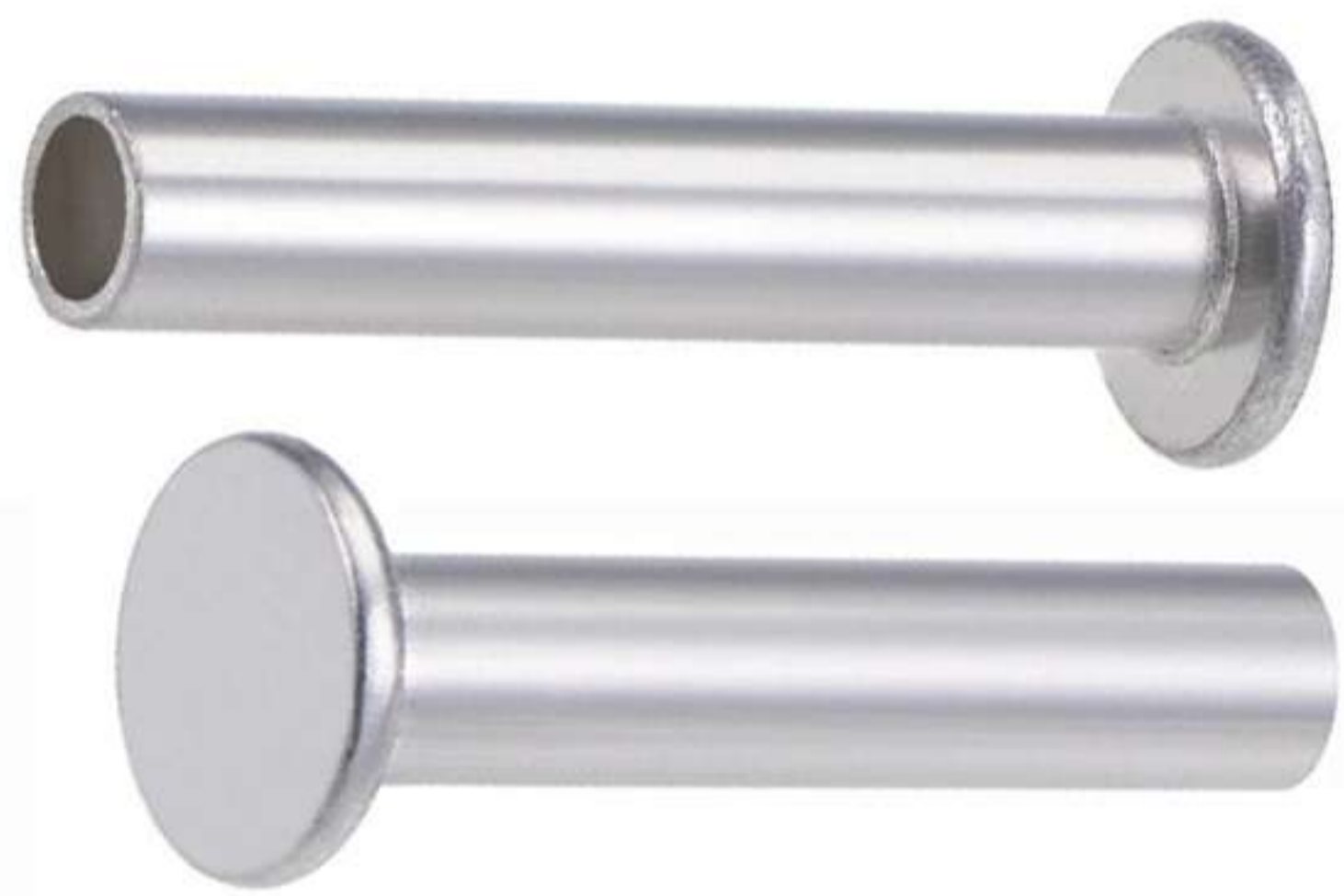
Semi Tubular Rivets