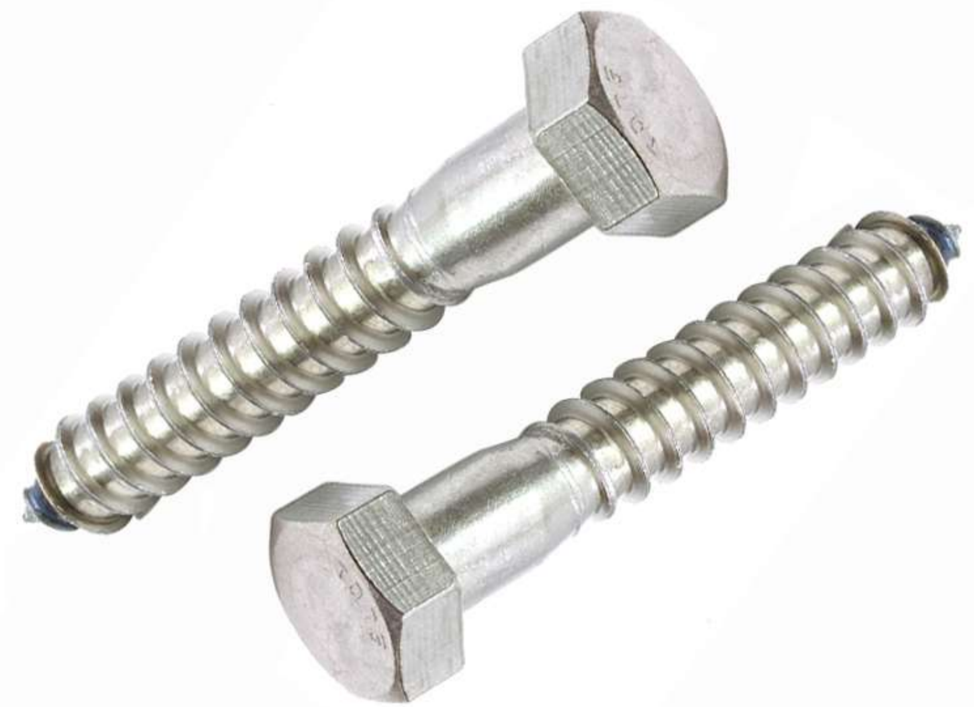
Hex Coach Screws