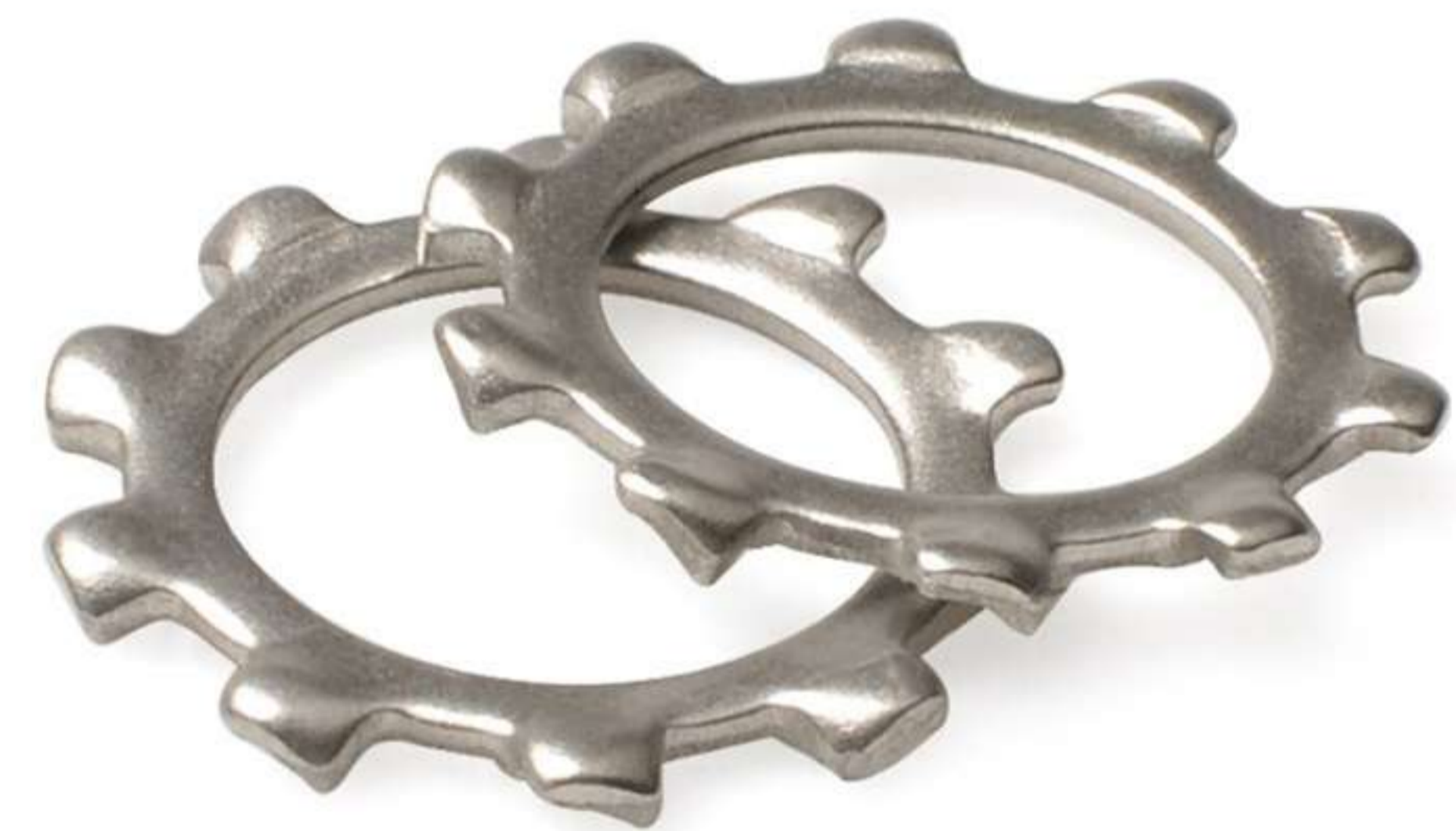
Toothed Lock Washers