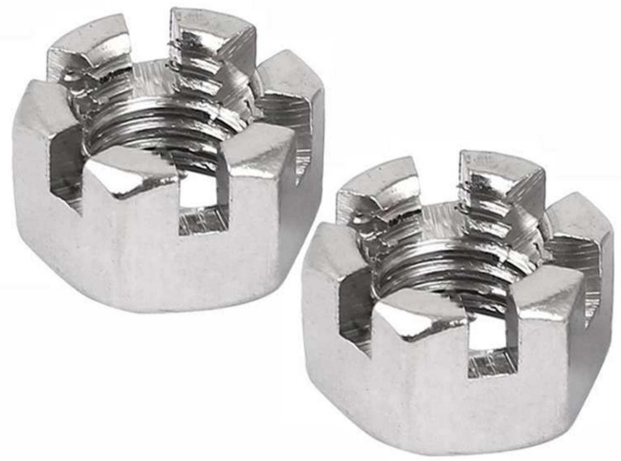
Hex Slotted Nuts