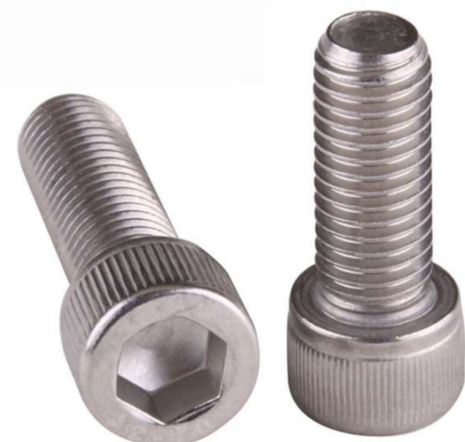
Socket Cap Screws